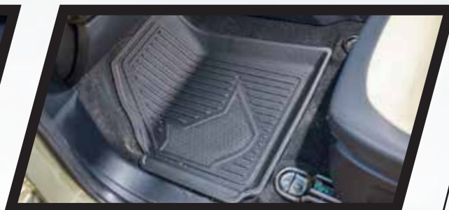
3D Mats for Cabin and Trunk