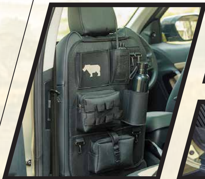
Back Seat Organiser