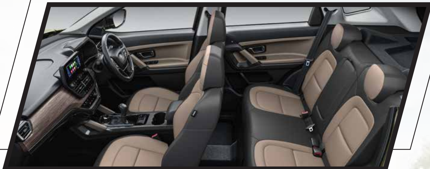
Exclusive Dual-Tone Earthy Beige and Black Finished Interior