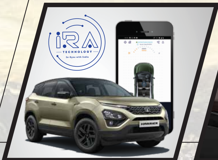
iRA - Connected Car Techonology**