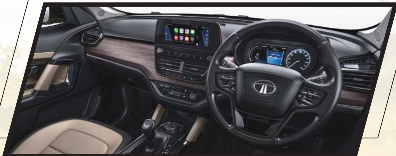
Exquisite Tropical Wood Finish Dashboard