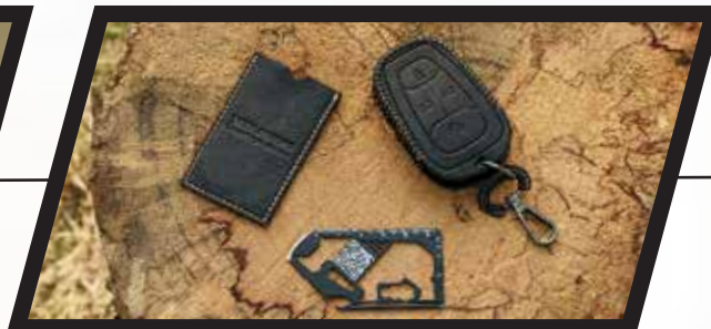
Key Cover & Rhino Shaped Multi-Tool