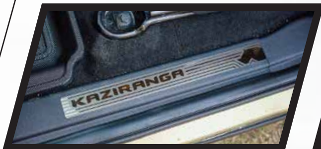
Interior Scuff Plates