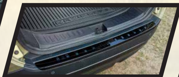
Tailgate Scuff Plate