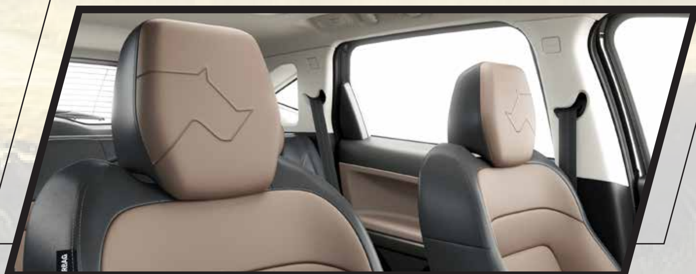
Premium Benecke Kaliko™ Leather# Upholstery with Rhino Embossed on Headrest