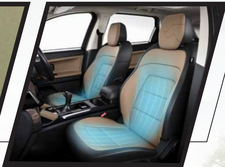
Ventilated Driver and Co-Driver Seats