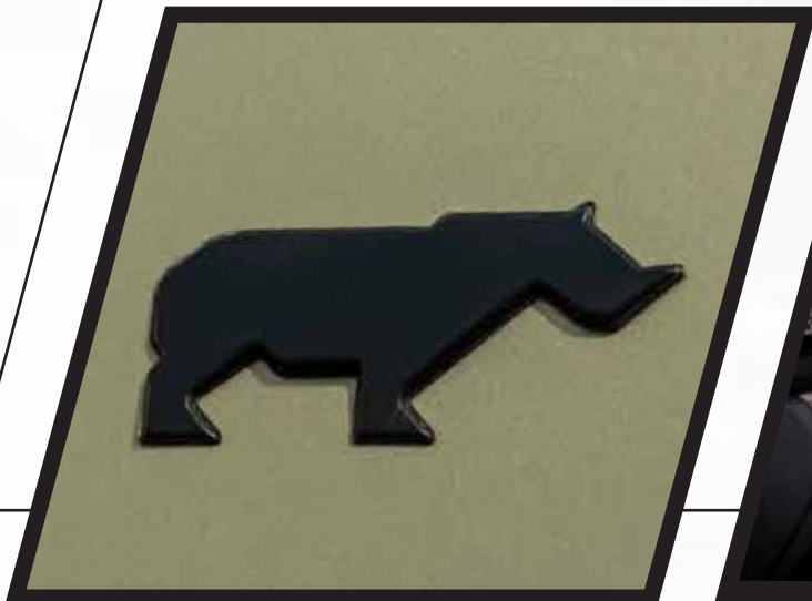
Satin Black Rhino Mascot on Fenders