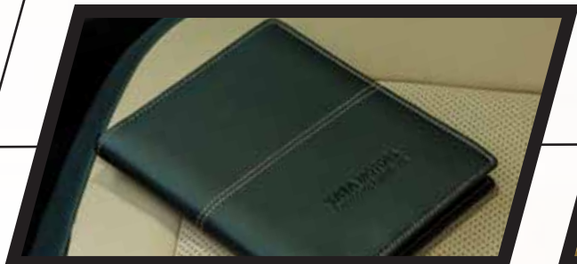
Premium Document Folder