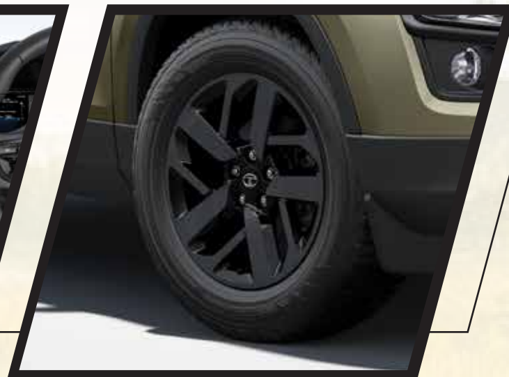
R17 Jet Black Diamond-Cut Alloys