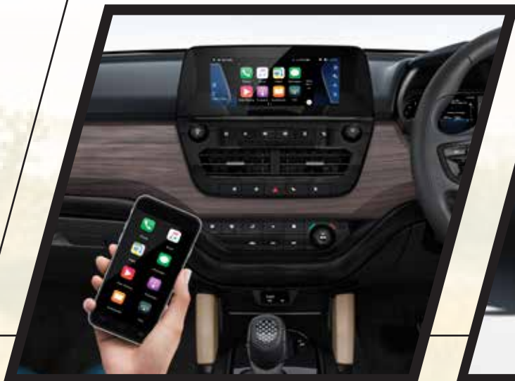
Android Auto™ & Apple CarPlay™ over Wi-Fi