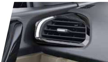
CHROME LINED SIDE AIRVENTS