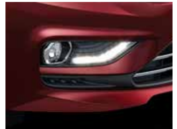
FRONT FOG LAMPS WITH CHROME RING SURROUNDS