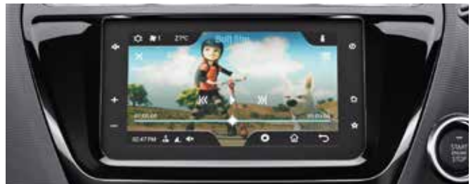
IMAGE & VIDEO PLAYBACK