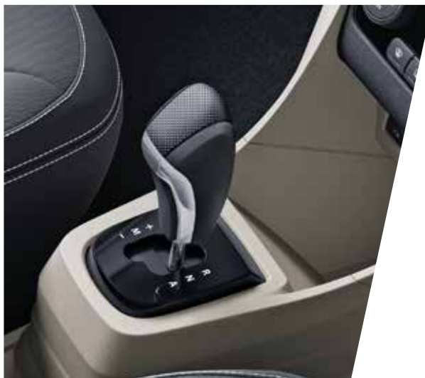
ADVANCE AMT TRANSMISSION