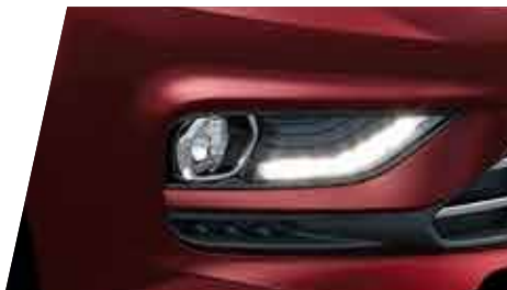
STRIKING LED DRLs