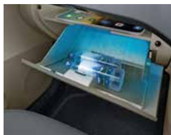
COOLED GLOVE BOX