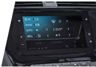
FULLY AUTOMATIC CLIMATE CONTROL