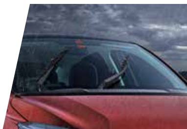
RAIN SENSING WIPERS