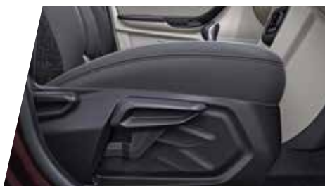
HEIGHT ADJUSTABLE DRIVER SEAT