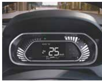
DIGITAL INSTRUMENT CLUSTER