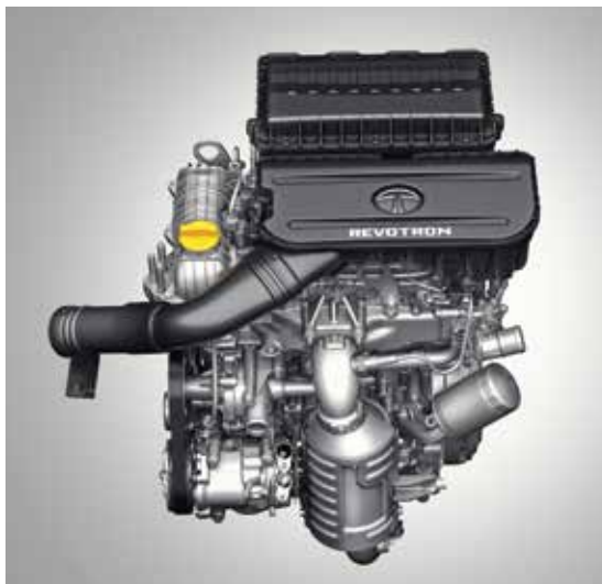
1.2L REVOTRON BS6 PH2 ENGINE