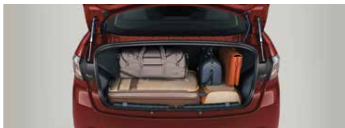
419L BOOT SPACE