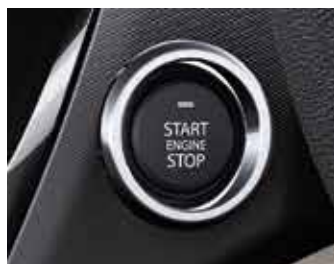
ENGINE START/STOP PUSH BUTTON