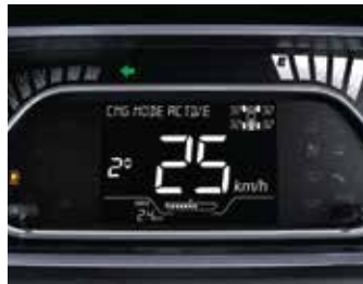
TYRE PRESSURE MONITORING SYSTEM