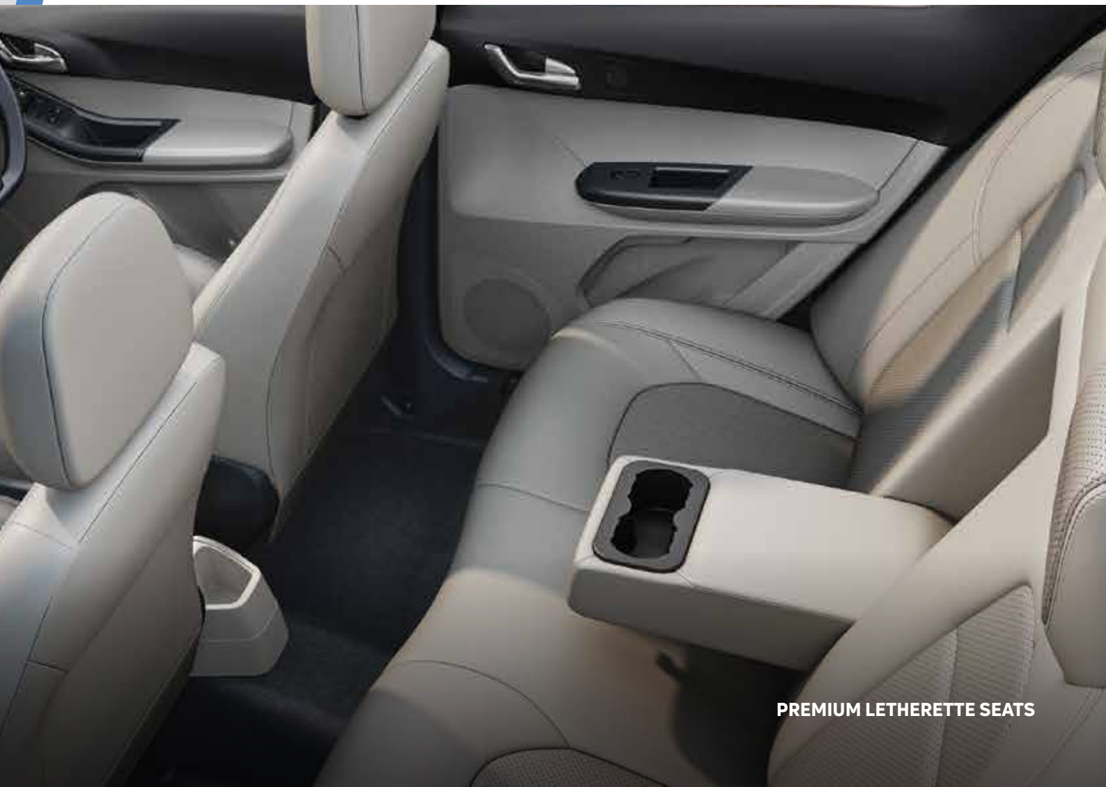
PREMIUM LETHERETTE SEATS