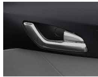
FRONT & REAR CHROME DOOR HANDLES