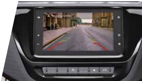
REAR PARKING ASSIST WITH CAMERA