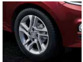
R15 SONIC SILVER ALLOY WHEELS