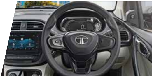
STEERING MOUNTED CONTROLS