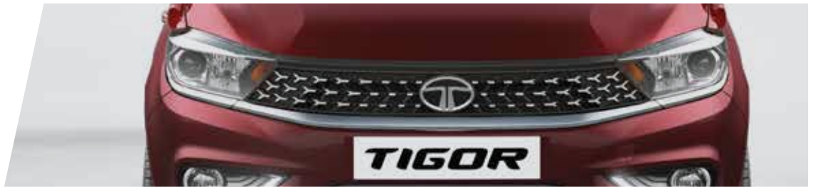
STYLISH CHROMED TRI-ARROW FRONT GRILLE