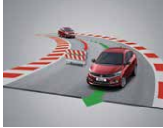
ABS WITH EBD AND CORNER STABILITY CONTROL