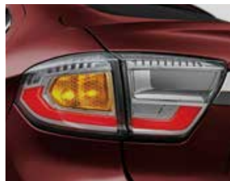
BOLD & BRIGHT LED TAIL LAMPS