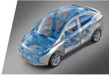
ENERGY ABSORBING STRUCTURE