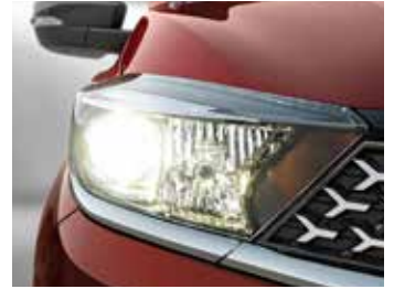
AUTOMATIC HEADLAMPS CONTROL